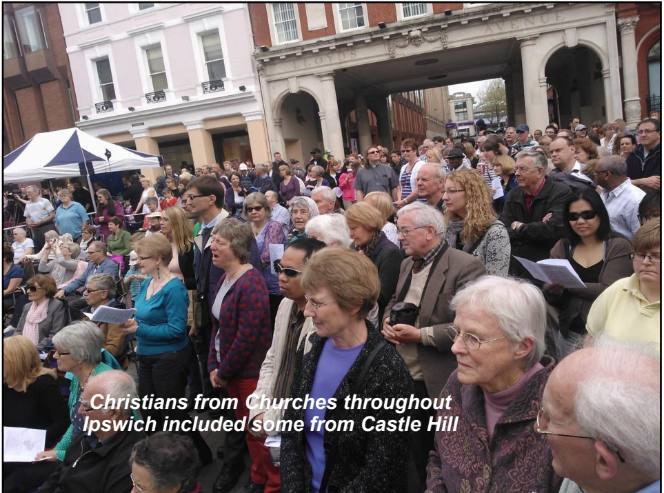
Christians from Churches throughout Ipswich included some from Castle Hill