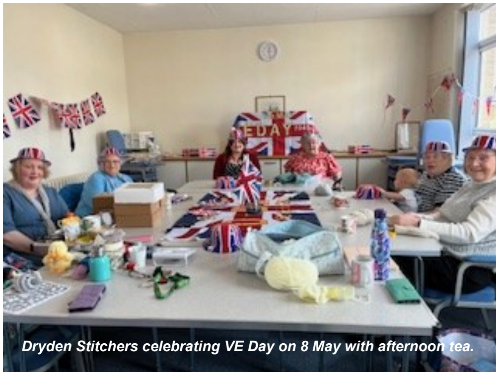
Dryden Stitchers celebrating VE Day on 8 May with afternoon tea.