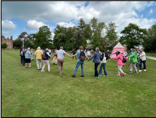
We danced in the afternoon at Kentwell Hall for Tudor May Day celebrations. . .