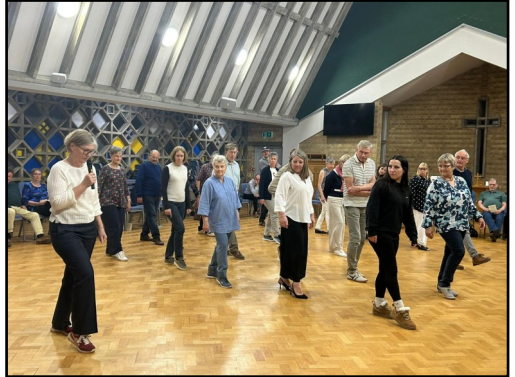
. . . and we danced in the evening at social event