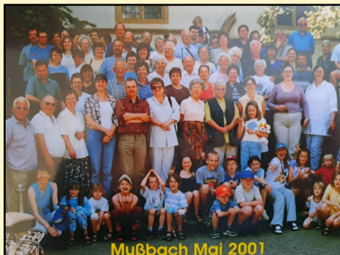
Mussbach visit in 2001

With Blessings and all Good Wishes The Castle Hill Church Family