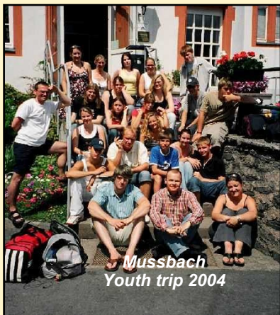
Mussbach Youth trip 2004