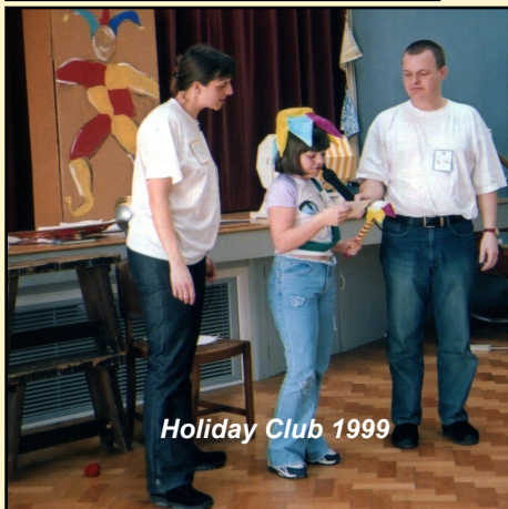
Holiday Club 1999